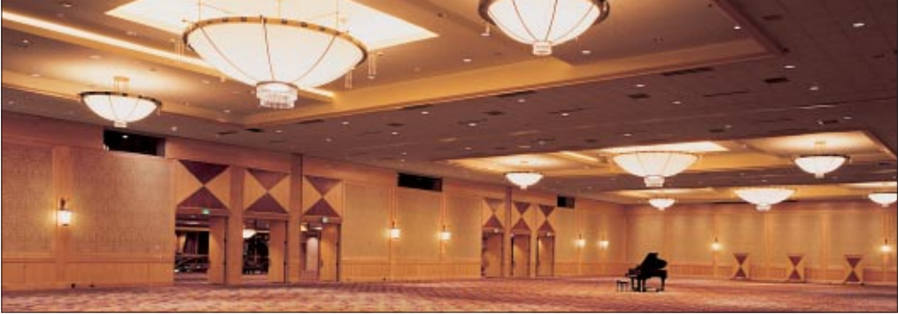
The Grand Ballrooms I, II, and III are linked together for one large event.