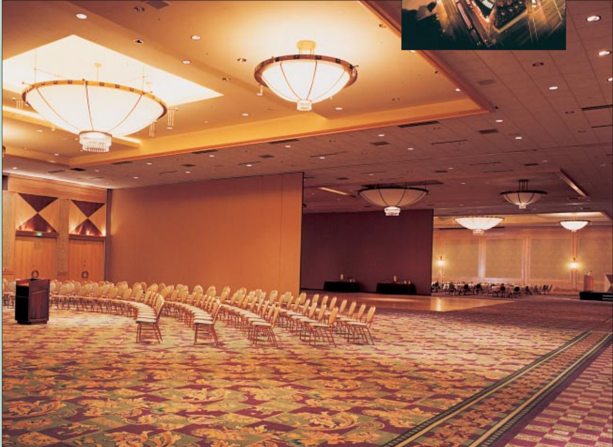
Above: The Grand Ballrooms I, II, and III partitioned for three events: Lecture, ballroom dancing class, and dinner meeting. Lighting controls are separated at the touch of a button for individual room control. Below: The lighting in ballrooms I and II are controlled as one for a reception. Ballroom III, in foreground, is controlled separately for another event.

The Westin Seattle selected Lutron's GRAFIK 6000® preset lighting control system for their ballroom renovation to handle the multiple set-up requirements for events and functions quickly and easily.