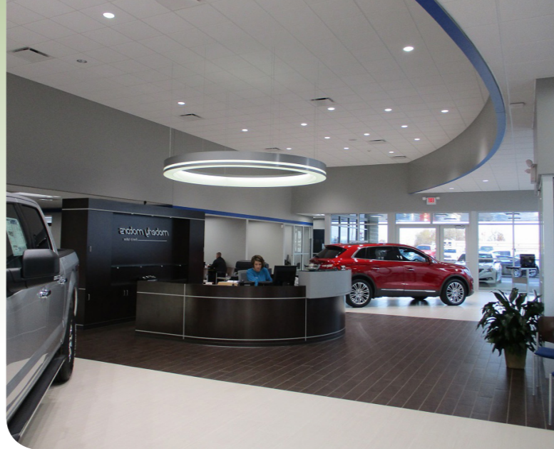
Vive controls ensure the proper lighting on the cars at all times — 150-200 fc (1,614 - 2,152 lx) during the day, and 75 fc (807 lx) at night when many customers like to window shop.

The showroom is set up with six different zones of control, all of which can be adjusted manually with Pico Wireless controls in the space, or with a quick tap on the Vive app from any enabled smart device.