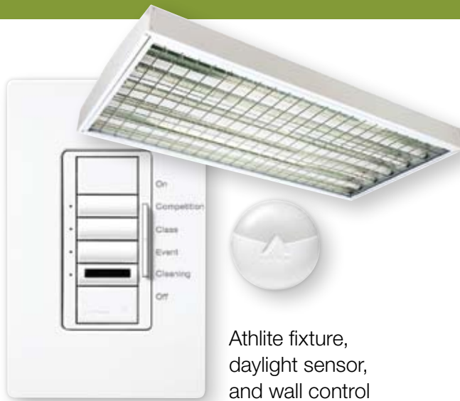
Athlite fixture, daylight sensor, and wall control

The high performance, energy-efficient lighting solution for gymnasiums