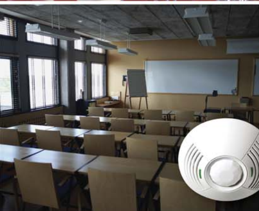
Lutron daylight sensor

Occupancy sensing Balance LC automatically shuts off lights when rooms are vacant.