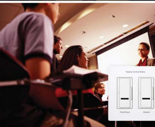
Lutron occupancy sensor

Manual dimming Balance LC gives teachers the ability to select light levels appropriate for any given task. Savings vary depending on the amount of dimming desired by the teacher.