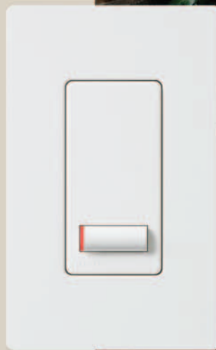
Lyneo Lx switch