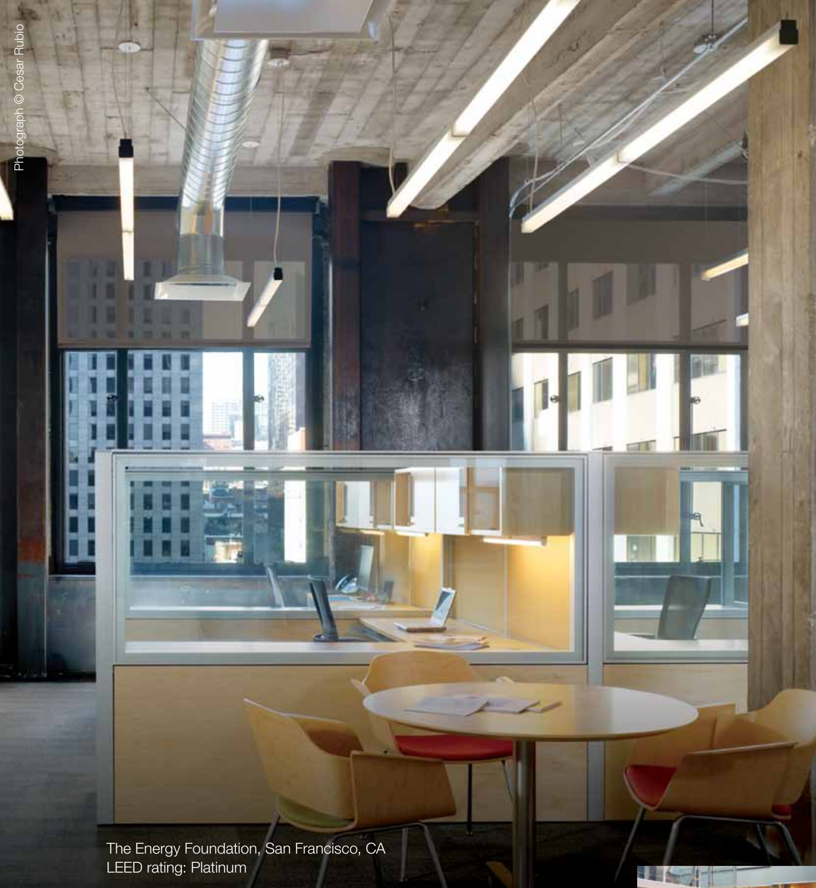
The Energy Foundation, San Francisco, CA LEED rating: Platinum