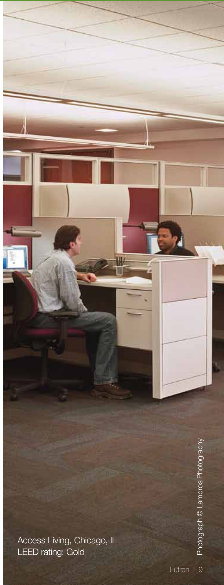
Access Living, Chicago, IL LEED rating: Gold