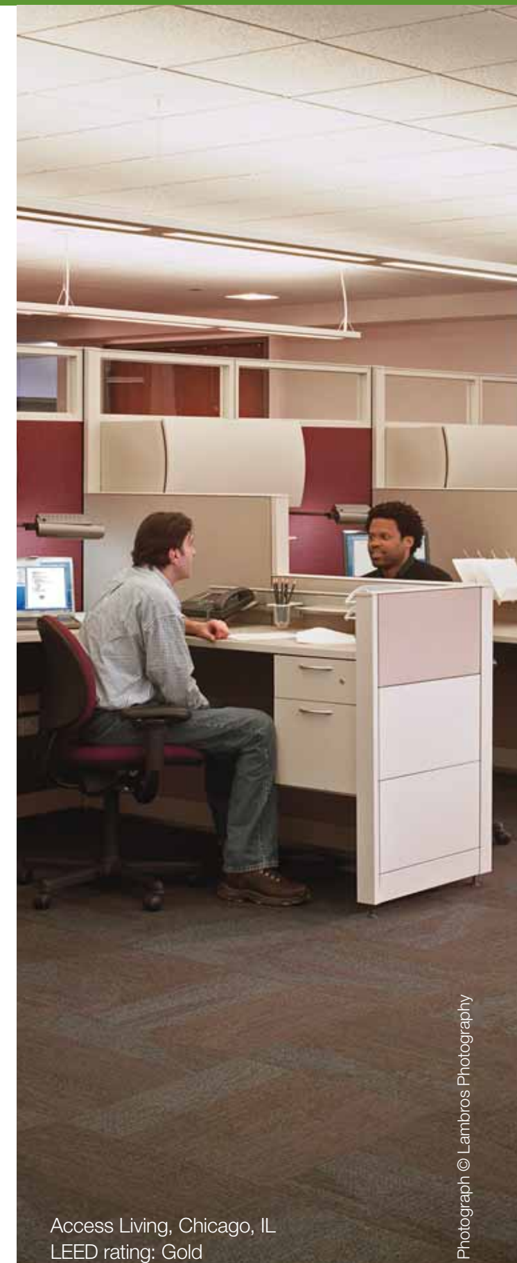
Access Living, Chicago, IL LEED rating: Gold