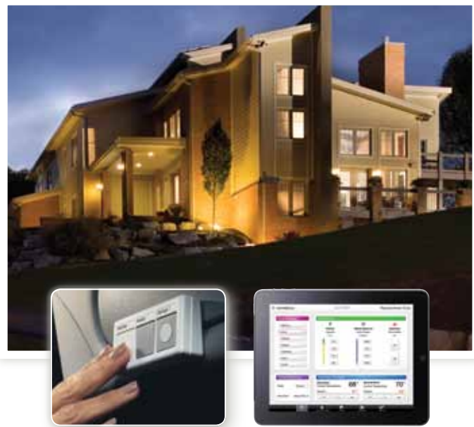
Car visor control