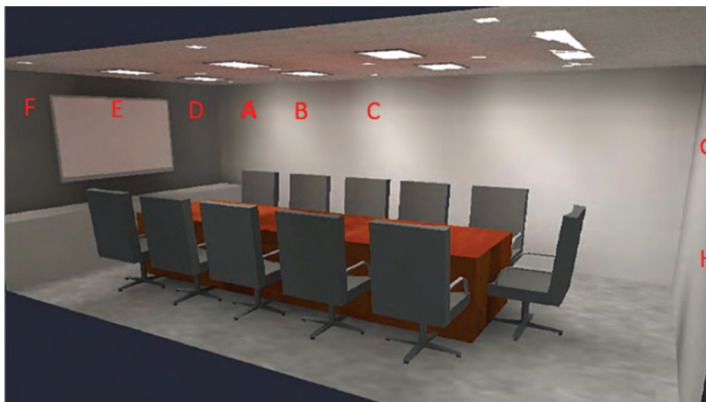
Figure 2 - Wall Measurement Points