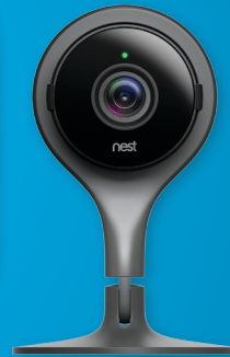
Nest Cam Indoor