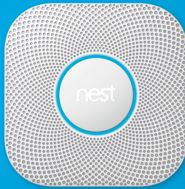
Nest Protect Smoke + CO Alarm