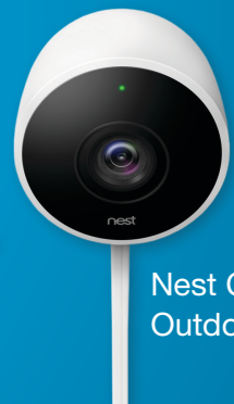
Nest Cam Outdoor