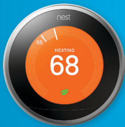
Nest Learning Thermostat