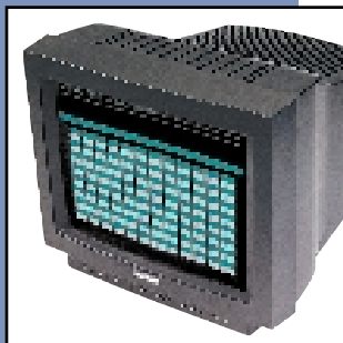
VGA DISPLAY AVAILABLE