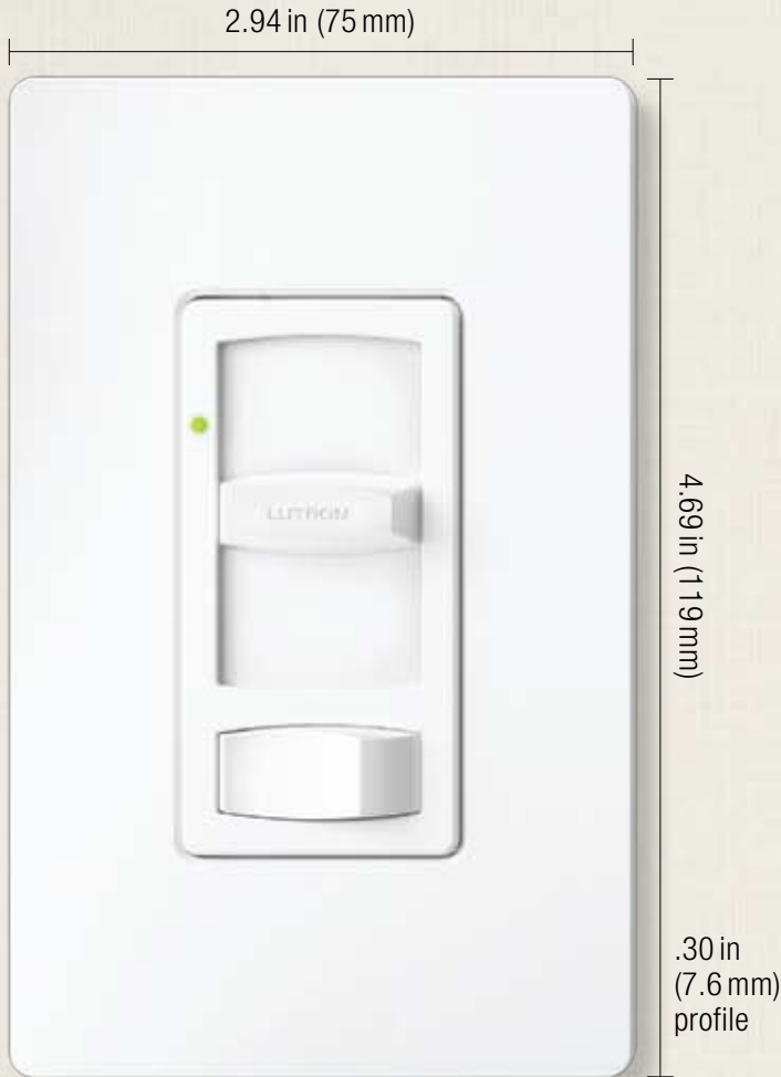
Shown actual size: MeadowLark dimmer and 1-gang Claro wallplate in White (WH).