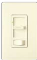
LA Light Almond