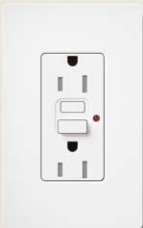
Tamper resistant GFCI receptacle