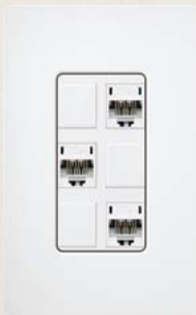
Customizable 6-port frame