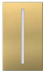
SB Satin Brass