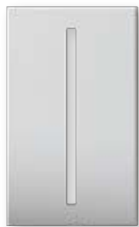
BC Bright Chrome