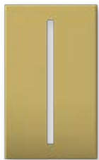
BB Bright Brass