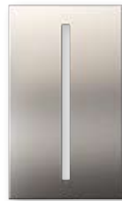
SC Satin Chrome