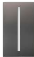
BLA Black Anodized Aluminum

*Metal finish wallplates include black plastic trim/adaptor, visible from side. Match with separate Black (BL) controls and accessories.