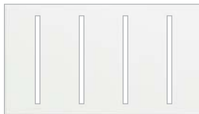
4-gang* VTW-4- AA 1 W: 8.45 in (215 mm); H: 4.56 in (116 mm); D: .30 in (7.6 mm)

AA 1 : Architectural matte and Architectural metal color codes, see pg. 149