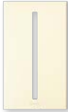
LA Light Almond