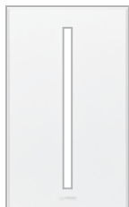
1-gang* VTW-1- AA 1 W: 2.75 in (70 mm); H: 4.56 in (116 mm); D: .30 in (7.6 mm)