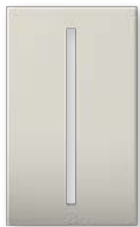
BN Bright Nickel