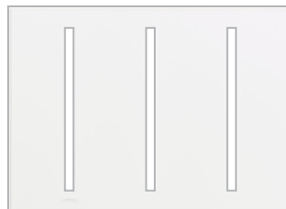
3-gang* VTW-3- AA 1 W: 6.32 in (161 mm); H: 4.56 in (116 mm); D: .30 in (7.6 mm)