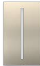
SN Satin Nickel