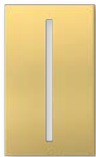
BRA Brass Anodized Aluminum