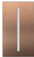
QB Antique Brass