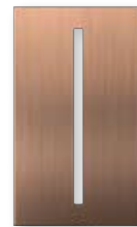
QZ Antique Bronze