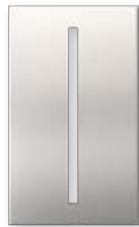
CLA Clear Anodized Aluminum