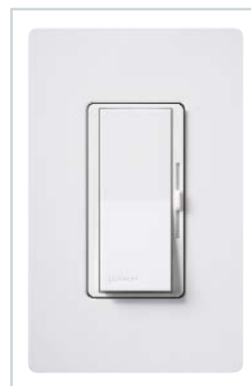
Diva® C-L™ Dimmer