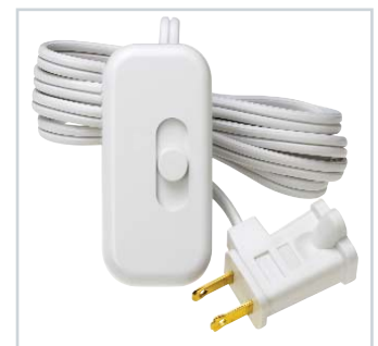
Credenza® C-L™ Dimmer