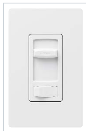
Skylark Contour™ C-L™ Dimmer