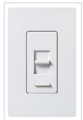
Luméa® C-L™ Dimmer

C-L™ dimmers from Lutron® are UL listed for controlling a variety of dimmable CFLs and LEDs, as well as an incandescent and halogen bulbs.