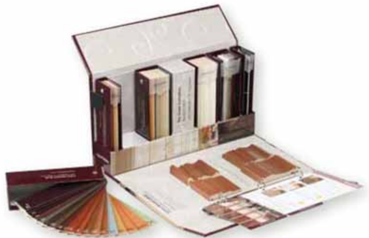
Venetian binder P/N VENETIAN-BINDER