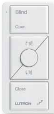
Pico® wireless control

Available for: Sivoia QS, Sivoia QS wireless