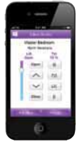
Home Control App for iPad®, iPhone®, and iPod touch®