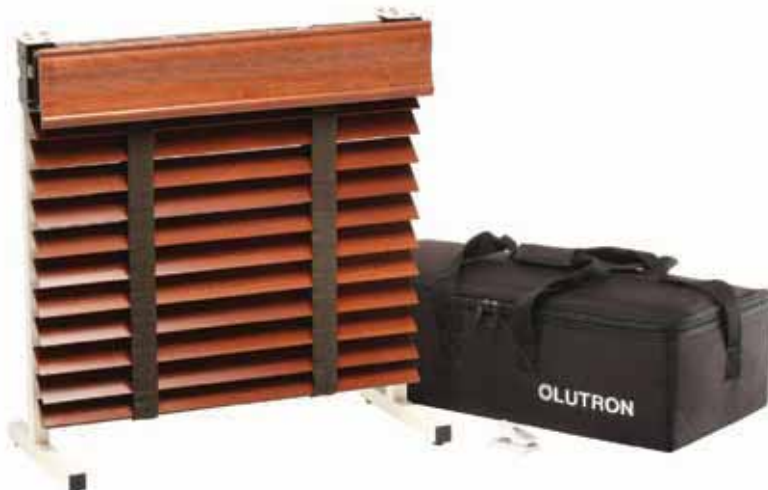
Venetian Demo P/N VENETIAN-DEMO-WD (shown) P/N VENETIAN-DEMO-AL (aluminium demo also available)

All marketing materials can be ordered using the shade configuration tool (SCT). PDFs are also available online at www.lutron.com under Service and Support.