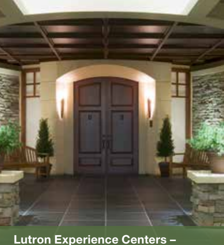
hands-on product knowledge

How did the design team decide on Lutron? A visit to the Lutron Experience Center in Coopersburg, PA made the decision easy. Their visit provided hands-on experience with the products and control strategies, and allowed them to see how the controls performed in practice, not just in theory.