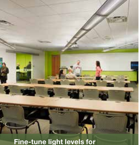
meetings and presentations.