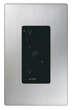
Pico wireless remotes in stainless steel faceplate.

"I used Designer* software to quickly layout the control system and generate the bills of material and one-line diagrams. The wireless installation saved time and increased flexibility for project adjustments. Once the controls were installed, I was able to setup this job with just my smart phone—no factory commissioning required," said Celillo.