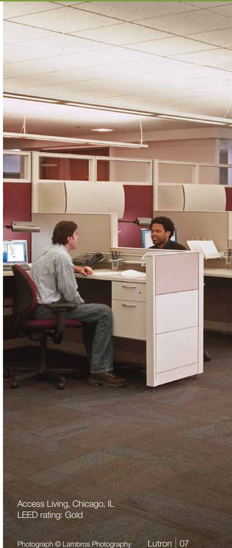
Access Living, Chicago, IL LEED rating: Gold

Lutron Greenovation® provides state-of-the-art classroom lighting with state-correlated energy lessons 3