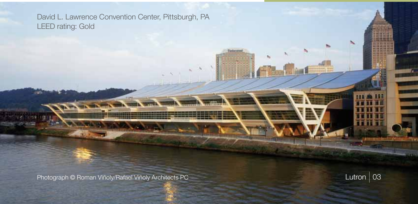
David L. Lawrence Convention Center, Pittsburgh, PA LEED rating: Gold