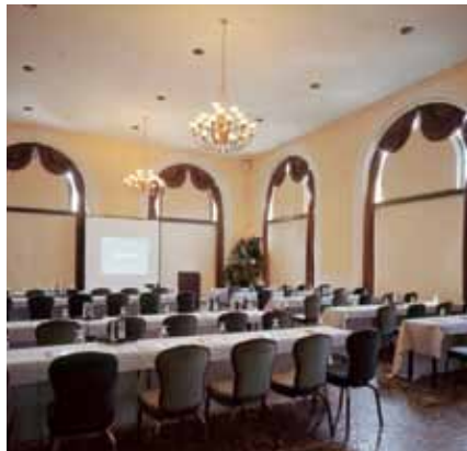
Hotel Bethlehem Bethlehem, Pennsylvania