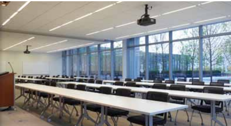
Panduit Chicago, Illinois

To request more information regarding upgrading or expanding your current system, please call 1.800.523.9466 or e-mail Projects@lutron.com