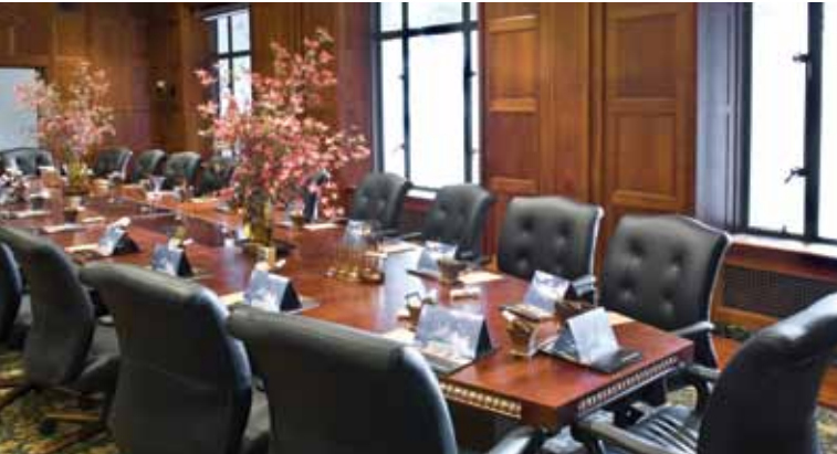
Bently Reserve & Conference Center San Francisco, California