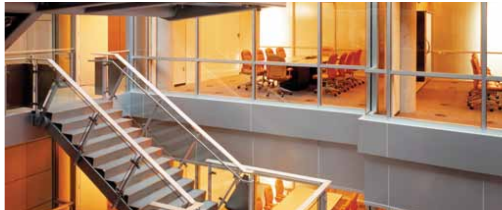
AOL Corporate Office Dulles, Virginia