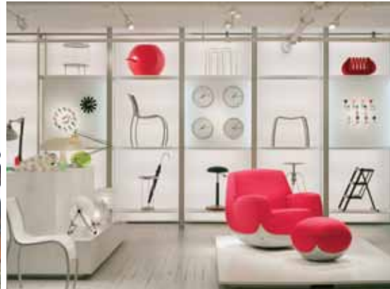
Moma Retail Store New York, New York