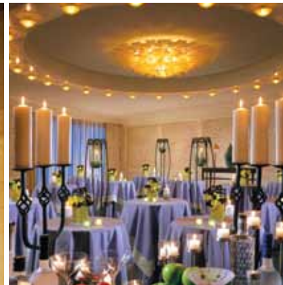
Hotel Four Seasons Boston, Massachusetts