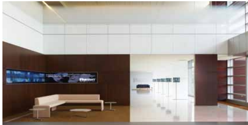
Panduit Chicago, Illinois