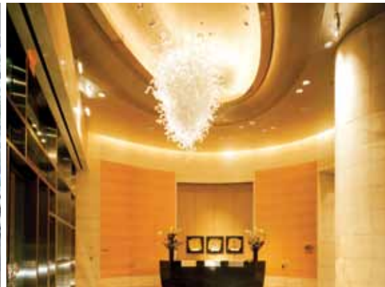
Hotel Mandarin Oriental New York, New York