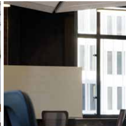
Energy Foundation San Francisco, California