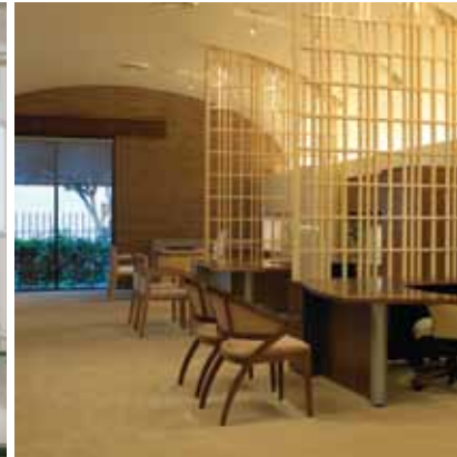
AllSteel Corporate Office San Francisco, California